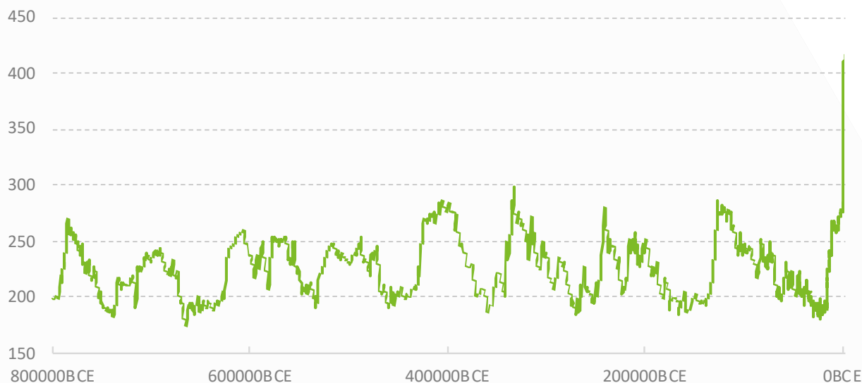
Figure 1: Global CO 2 Atmospheric Concentration (ppm) 5

According to the World Meteorological Organization (WMO), the global mean temperature in 2021 is estimated to have been 1.21°C (2.17°F) above the average temperature from 1850-1900, a period often used as a pre-industrial baseline for global temperature targets. It is the seventh consecutive year (2015-2021) that the global temperature has been over 1°C above pre-industrial levels. 6